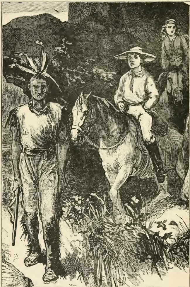
THROUGH THE DEFILES OF THE SAWBACK HILLS.—PAGE 160.